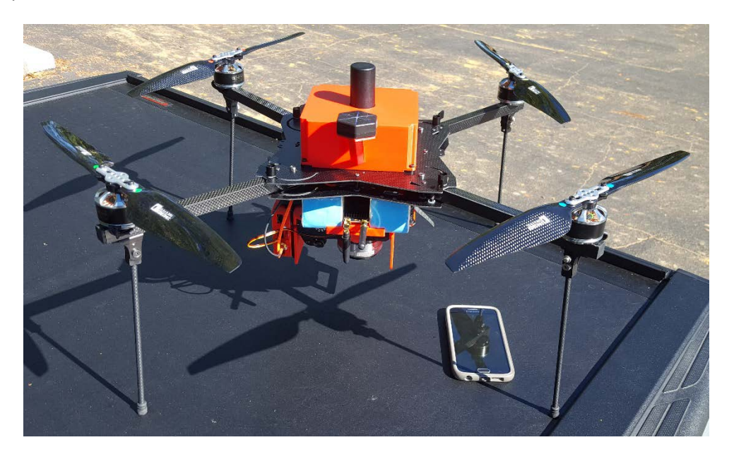
Figure 2: V-Map Air mounted on a small Survey Copter

The V-Map system has been designed to be UAV-independent. It can be used as an air-borne rover, an on-the-pole rover or as a reference station.