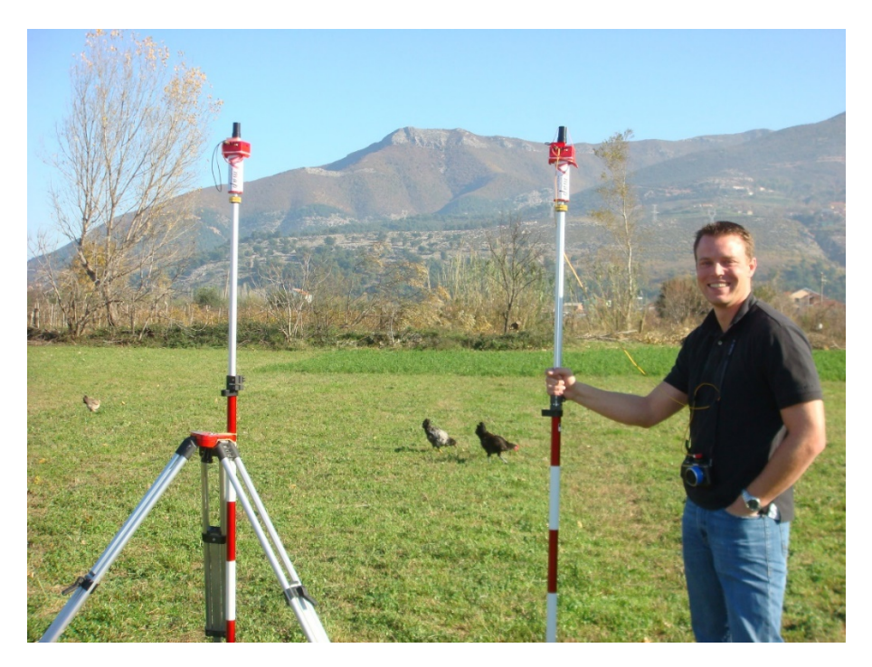
Figure 4: A pair of pole mounted V-Map Systems being employed in a post-processed kinematic survey.

As shown in Figure 4 below, V-Map Air can be used as rover or reference receiver.